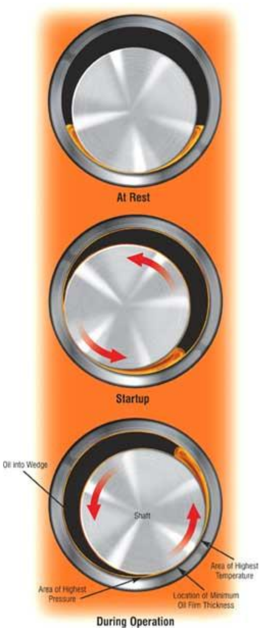
Figure 3. Shaft Motion During Startup

Normally, the minimum oil film thickness is also the dynamic operating clearance of the bearing. Knowledge of the oil film thickness or dynamic clearances is also useful in determining filtration and metal surface finish requirements. Typically, minimum oil film thicknesses in the load zone during operation ranges from 1.0 to 300 microns, but values of 5 to 75 microns are more common in midsized industrial equipment. The film thickness will be greater in equipment which has a larger diameter shaft. Persons requiring a more exact value should seek information on the Sommerfeld Number and the Reynolds Number. Discussion of these calculations in greater detail is beyond the scope of this article. Note that these values are significantly larger than the one-micron values encountered in rolling element bearings.