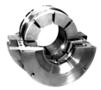
Figure 1. Kingsbury Radial and Thrust Pad Bearing

Tilting-pad or pivoting-shoe bearings consist of a shaft rotating within a shell made up of curved pads. Each pad is able to pivot independently and align with the curvature of the shaft. A diagram of a tilt-pad bearing is presented in Figure 1. The advantage of this design is the more accurate alignment of the supporting shell to the rotating shaft and the increase in shaft stability which is obtained.<sup>1</sup> An article on tilting-pad bearings appeared in the March–April 2004 issue of Machinery Lubrication magazine.